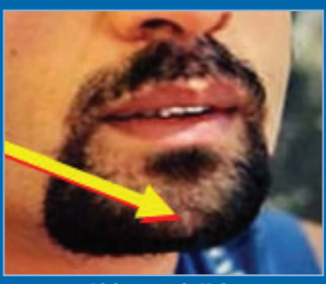
Half face & full face: Unacceptable for fit test Reason: Hair is in sealing region under the chin and on the cheeks