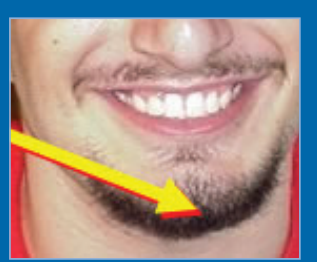
Half face & full face: Unacceptable for fit test Reason: Hair is in sealing region under the chin