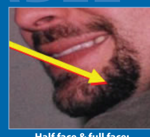
Half face & full face: Unacceptable for fit test Reason: Hair is in sealing region under the chin